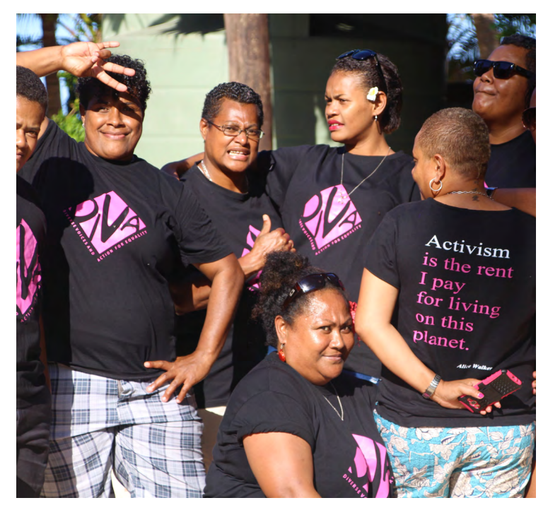
DIVA for Equality, Fiji

Courageous women's, girls', and trans and intersex people's human rights organisations worldwide need funding and supportive networks in order to grow and transform their communities. Mama Cash mobilises resources from individuals and institutions, makes grants to these self-led, feminist organisations, and helps to build the partnerships and networks needed to successfully defend and advance women's, girls', and trans and intersex people's human rights globally.