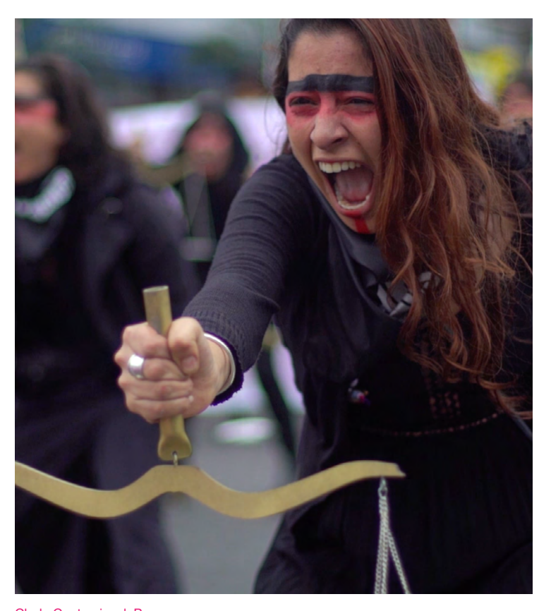
Chola Contravisual, Peru

The start of the 2020s has been indelibly marked by the COVID-19 global pandemic and uprisings in defence of Black bodies and lives around the world. Activists' work to respond to the unequal consequences of the pandemic as well as to lift up and defend Black life show us how long-entrenched norms, behaviours, and systems can be changed - even overturned - when we are intentional and committed.