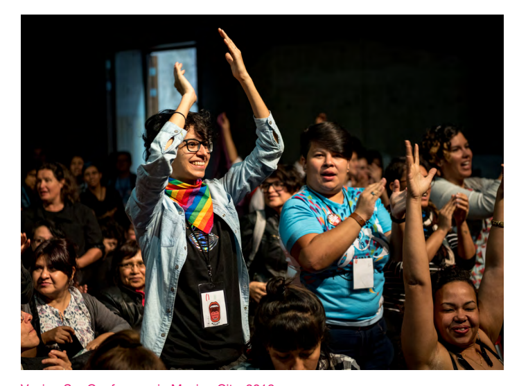
Venir a Sur Conference in Mexico City, 2018

ACCOUNTABLE - we recognise that we are in community with others and are accountable to those we share this work with. We commit to openness in giving and receiving feedback, transparency and power-sharing in our decisionmaking, and honesty in our communications.