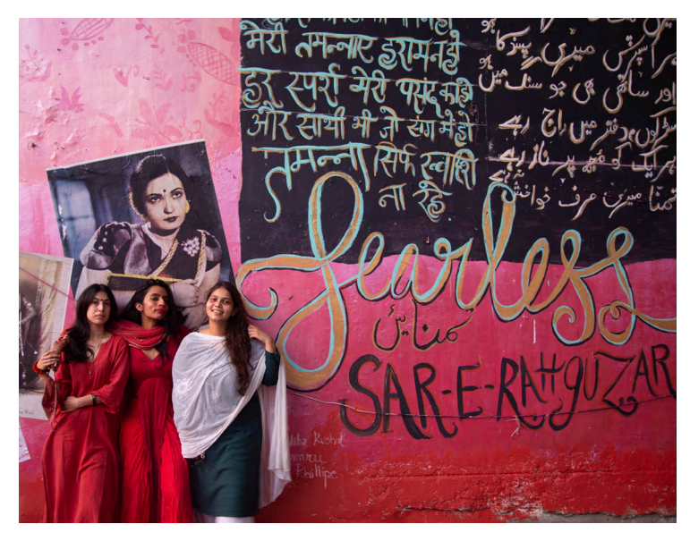
Fearless Collective, Sri Lanka

The accompaniment strategy supports grantee-partners to obtain, improve, and retain skills, knowledge, tools, equipment, and other resources needed to fulfil their missions. This can take shape as financial and non-financial support. Mama Cash's basic criteria for all funding streams prioritise groups, individuals, and women's funds that: