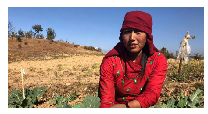
National Indigenous Women Forum, Nepal

Worldwide, feminist movements are critical actors in creating fairer and more just societies, and they are rising to meet new and long-standing challenges. Yet their resource needs remain unmet by the funding sector; they continue to receive less than 1% of all gender-focused aid for example. This moment, therefore, requires Mama Cash to deepen and strengthen our work to support and propel this collective work forward. We are determined to do our best to match the courage, need and opportunity of the moment and the movements we work with.