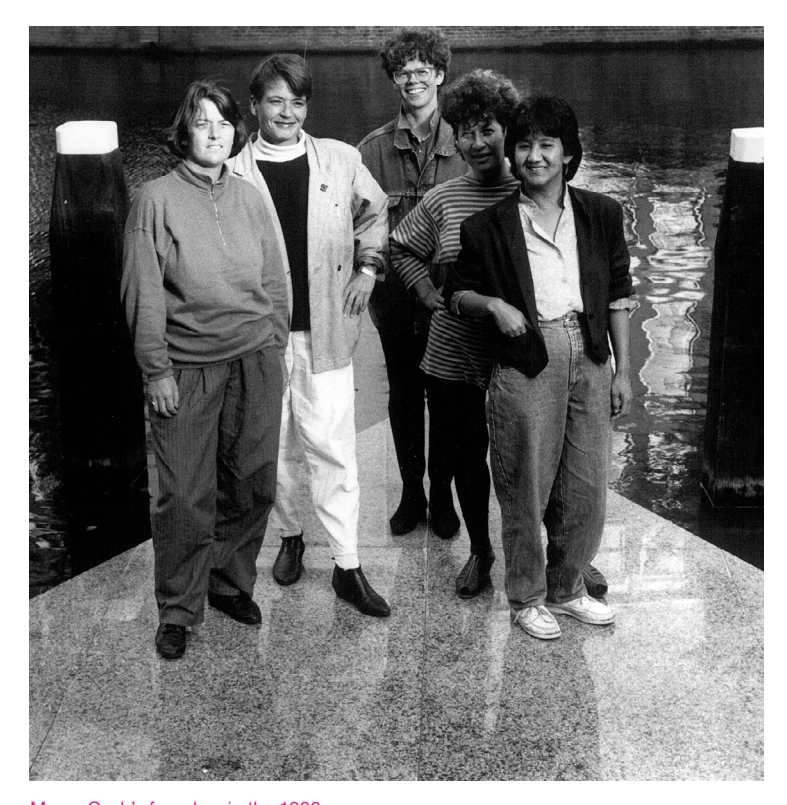
Mama Cash's founders in the 1980s.

Over time, as feminist political analysis has broadened and deepened, we have expanded our mission to reflect these realities of feminist movements. In 2012, we included support for trans people's rights in our mission, and in 2018, we added support for intersex people's rights. Over the course of almost four decades, Mama Cash has grown, yet our core identity and mission have not wavered. We remain a funder of bold feminist activism.