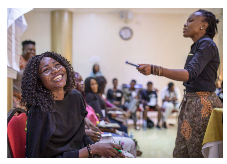
Women's Health and Equal Rights, Nigeria

Purpose for us incorporates Learning, Monitoring and Evaluation (LME), Finance and Grants Administration, IT and Office Management, and Risk Management and Quality Control.